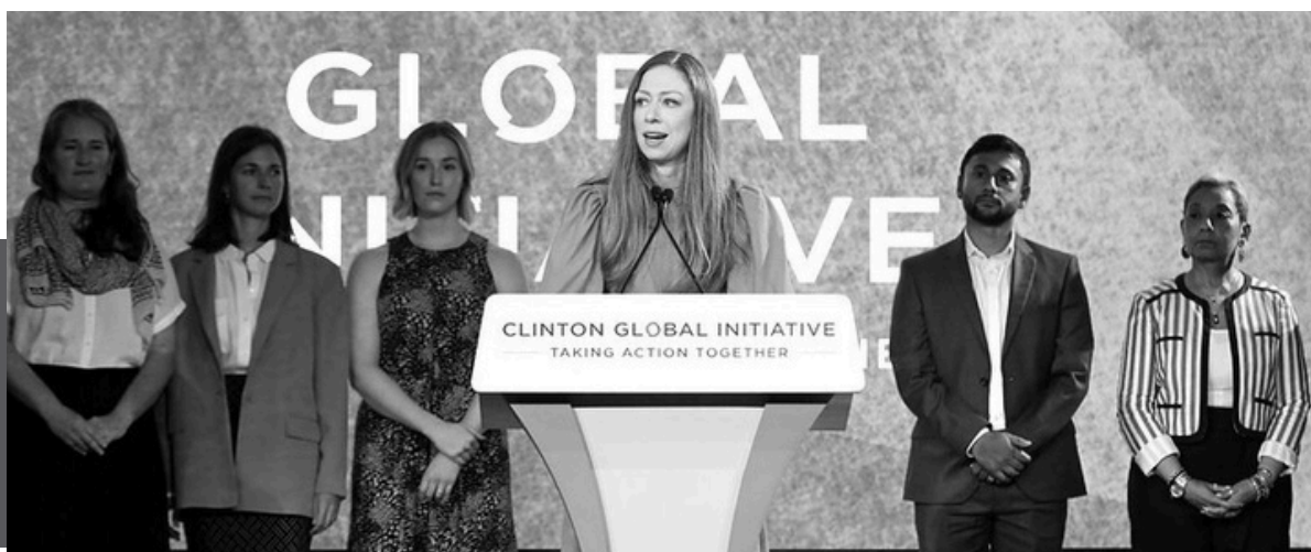
CHC Staff Celebrated Commitment to Action at the Clinton Global Initiative (CGI) 2023 Meeting in New York

With nearly 70 babies born into the Black Birthing Initiative so far this year, we see our model working as proven by an estimated 31% reduction in expected preterm births, 8% reduction in maternal stress, reduced food insecurity, and more.