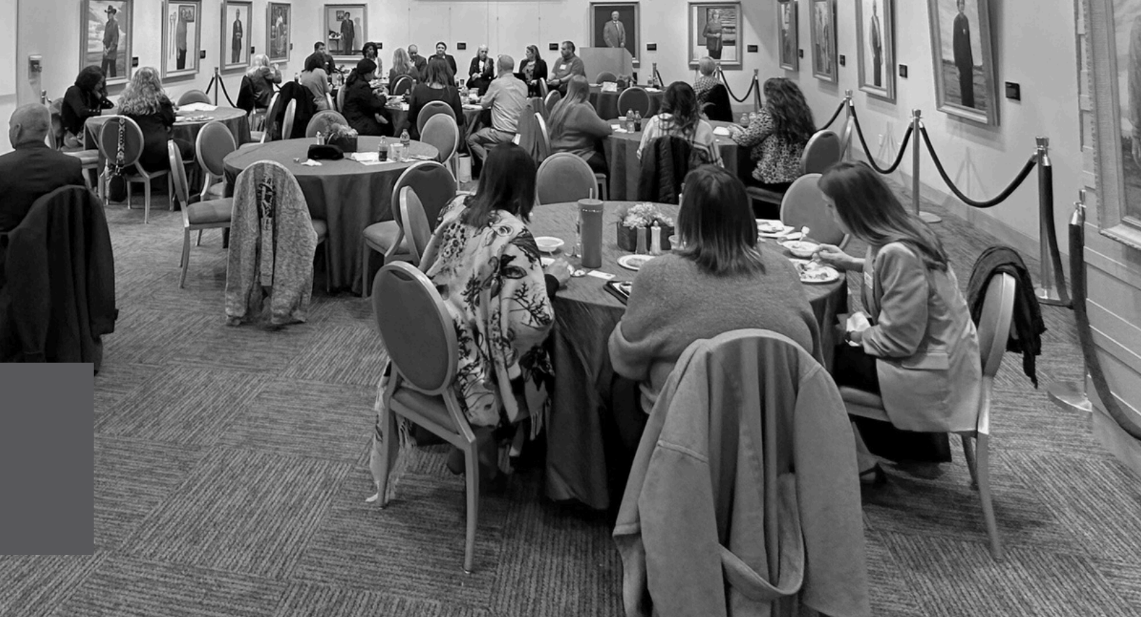
CHC, along with community-based organizations and Native American experts, hosted a Mental Health and Substance Use Disorder Convening in Oklahoma