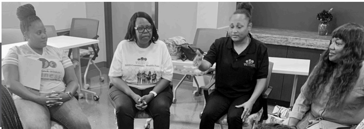
CHC hosts community listening sessions and focus groups across the U.S. to inform our health equity work

We apply an equity and justice focused lens to all our work; aiming for population and community health impact by addressing the access, systemic and structural barriers in communities most affected by the social drivers of health.