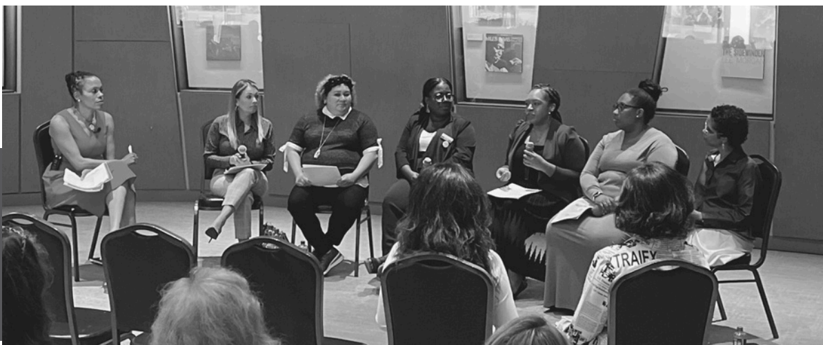
CHC hosted a community conversation on barriers to wellness for Black and Latine women in Atlanta